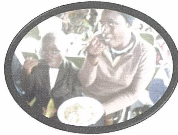
Supported by the Capuchin Friars Shisong.